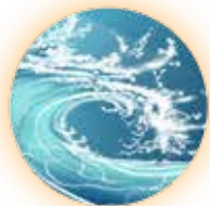
YIN side Passive