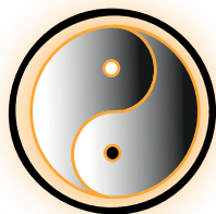
2 sides Balance