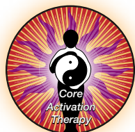
YANG side Active