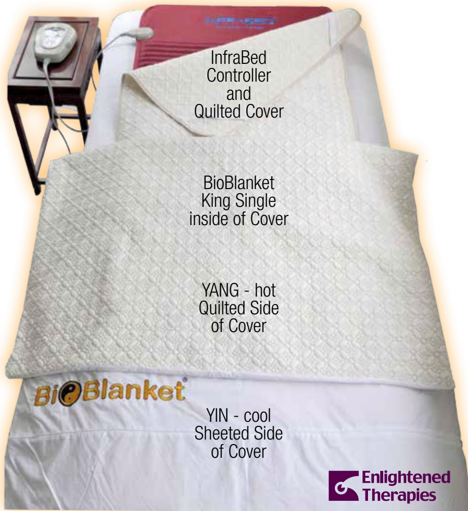
InfraBed Controller and Quilted Cover

BioBlanket helps InfraBed build Core Temperature and Circulation